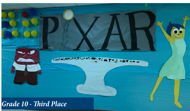
Grade 10 - Third Place