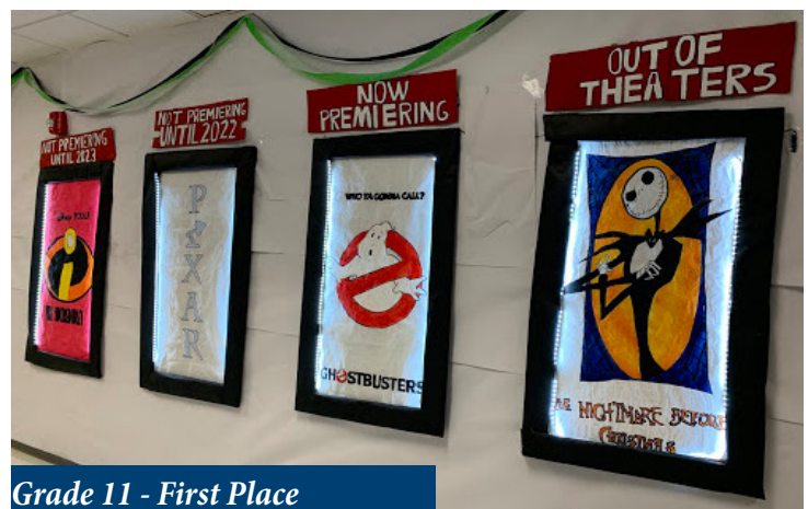
Grade 11 - First Place