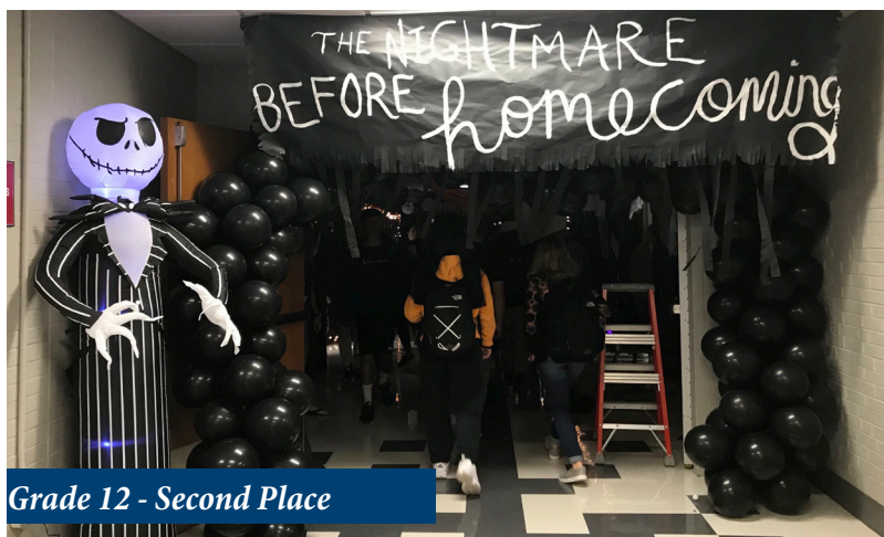
Grade 12 - Second Place